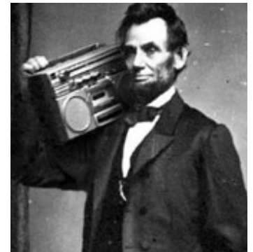
Squanto's and Abe's friendship ended, however, when Lincoln suggested that the Indians incorporate dubstep into their traditional drumming songs.

Have a wonderful Thanksgiving, Yay pieeeeeees! All of the food!! And beeeeeers! 🍷